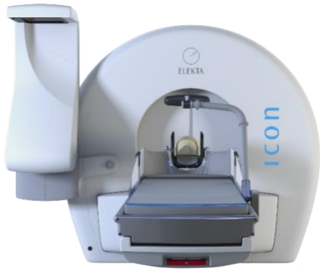
Leksell Gamma Knife Icon allows Gamma Knife Radiotherapeutics to expand patient treatment options

Leksell Gamma Knife® Icon™ represents brain treatment innovation, enabling Gamma Knife Radiotherapeutics physicians to offer unparalleled precision and accuracy without some of the side effects associated with traditional treatment approaches. As Sanjay Ghosh, MD, FAANS, Medical Director GKR , explains, “Approaching brain lesions with either surgical or with whole brain irradiation carries potential complications, side effects or even death due to factors such as the lesion’s depth and inaccessibility, its closeness to critical structures, and the radio-sensitivity of adjacent vital tissues. Even if accessible, open surgery still involves risks such as hemorrhage, infection and other post-operative complications, as well as a hospital stay and lengthy recovery.”